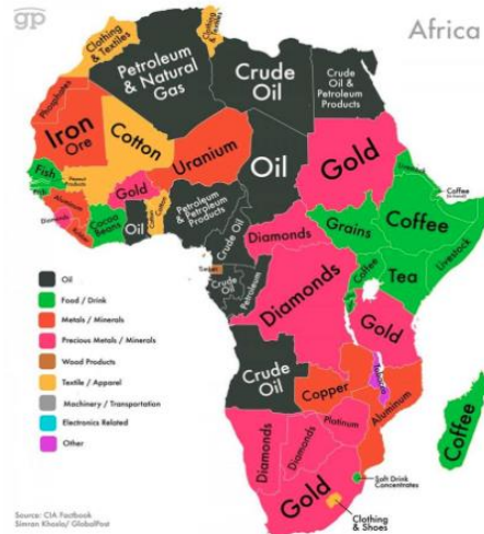
Figure 4 Resource Map of Africa https://www.worldbulletin.net/world/mapping-africas-natural-resources-h191272.html

capitalist interest which helps her to sustain economic hegemony through military means. (Bando 2021).