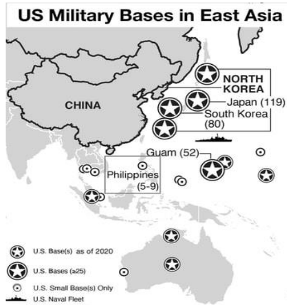
Figure 2 US Military Bases in East Asia.

seeking more accessible places for light and flexible operations, as the US wants to play in China's backyard. (Wingfield-Hayes 2023)