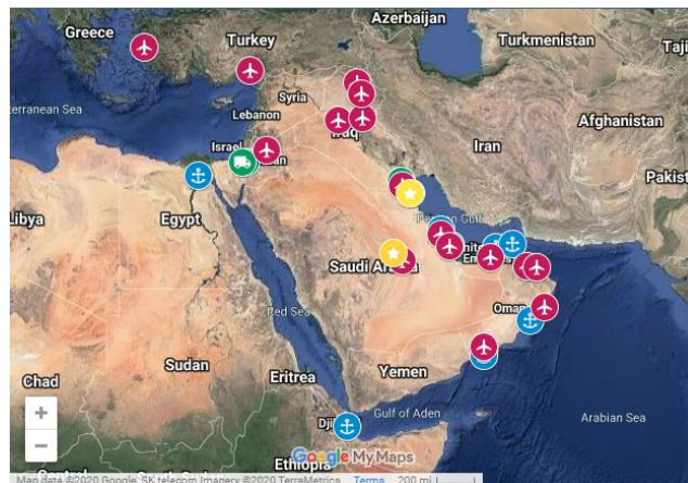
Figure 3 US Bases in Middle East ( https://www.americansecurityproject.org/national-security-strategy/u-s-bases-in-the-middle-east/ )

US military presence in Middle East dates back to Second World War. Interesting aspect of US presence in Middle East is that it has bases in friendly Arab states as well as in Israel. Though this strategic presence has caused controversy, yet USA acclaims that its presence in the region is the cause of stability and peace in world most volatile region.